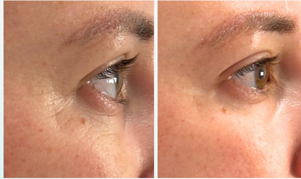
Crows feet & under eye lines